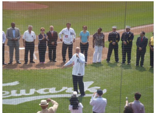
Above: Newark Mayor Cory A. Booker at Let's Move! Newark event

www.mayorswellnesscampaign.org/the-mayors-wellness-campaign-first-lady-michelle-obama-lets-move-and-work-on-childhood-obesity/