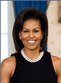
Michelle Obama First Lady- USA Founder of Let's Move!