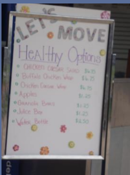
Above: Healthy Options menu at the "Let's Move" Event at Newark Bears Stadium May 26th, 2011